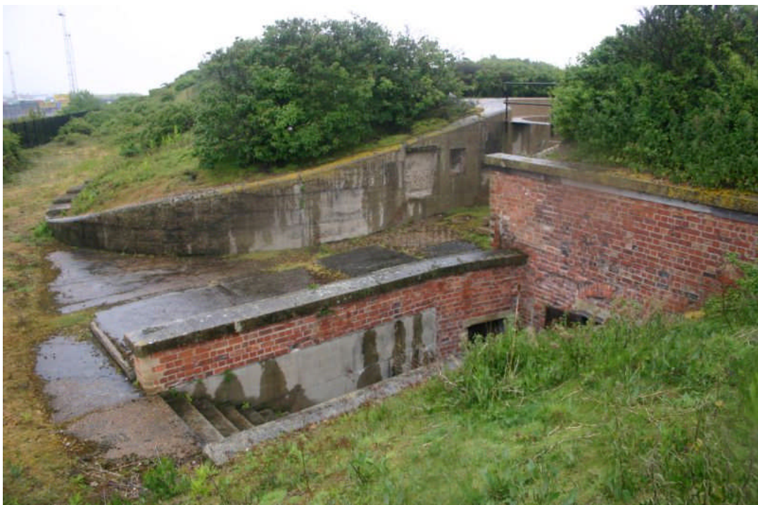
Landguard Left Wing Battery